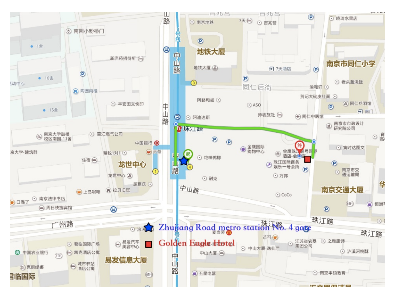
Figure 1: From Zhujiang Road station to Golden Eagle Hotel.